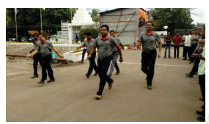
Employees in full swing for fast walk competition