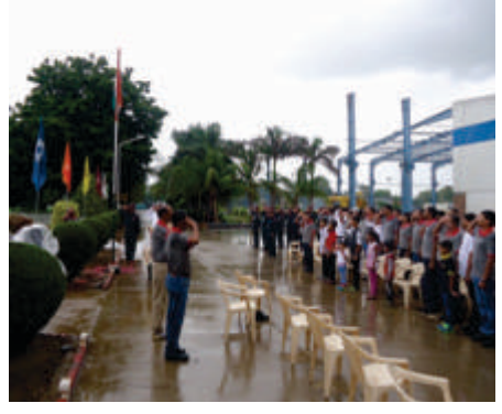
Employees saluting the National Flag at Karjan plant