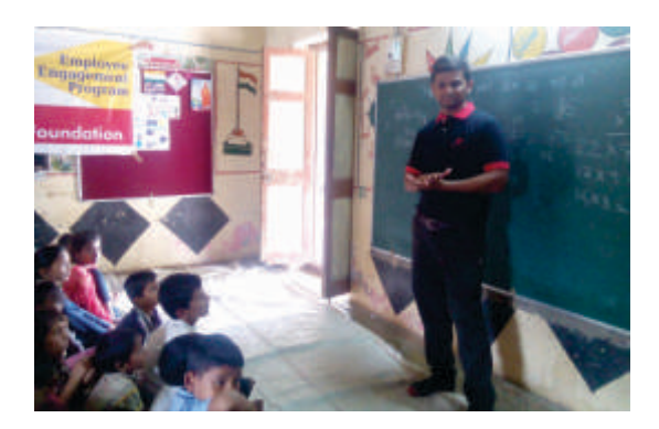
Cosmo Films representative taking a session

The Gujarat Innovative Council, Vadodara had organized Tod, Fod, Jod workshop on 21st August, 2016 wherein three teachers from Cosmo Foundation (CF) participated. It involved interesting activities where participants had to open fan, cycle, key board, desk top, water tap, food mixture, split ACs etc. and other nonfunctional gadgets and manufacture some utility items out of it. The workshop gave an opportunity to the teachers to think out of the box and apply innovation in teaching.