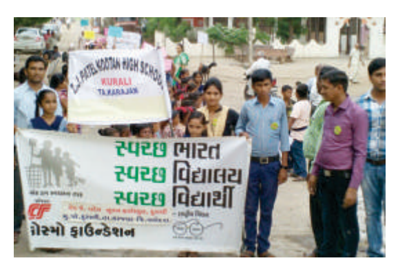
Students spreading the message of Clean India at Kurali village