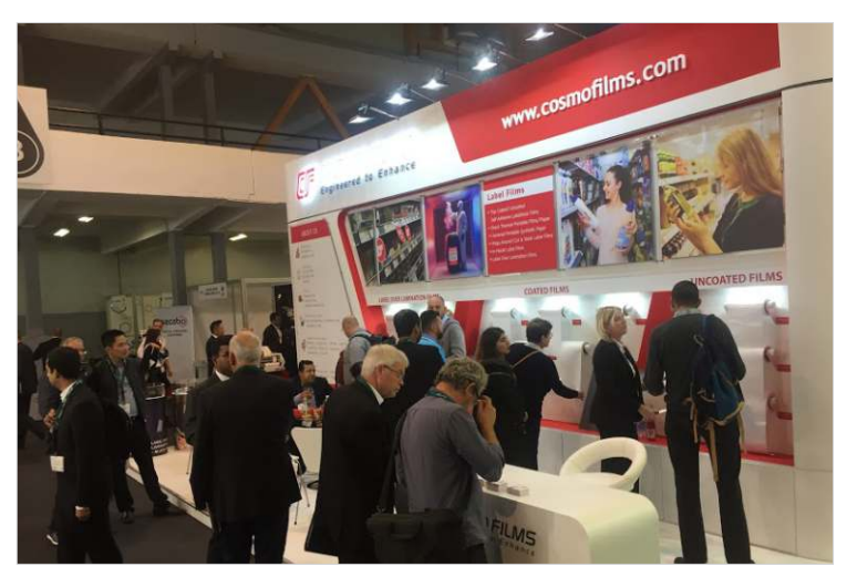
Cosmo Films at Labelexpo Europe 2017

Significance: Labelexpo Europe is the world's largest event for label and package printing industry. The company showcased its speciality PSA labeling product at the show and received overwhelming response from the key stakeholders of the industry.