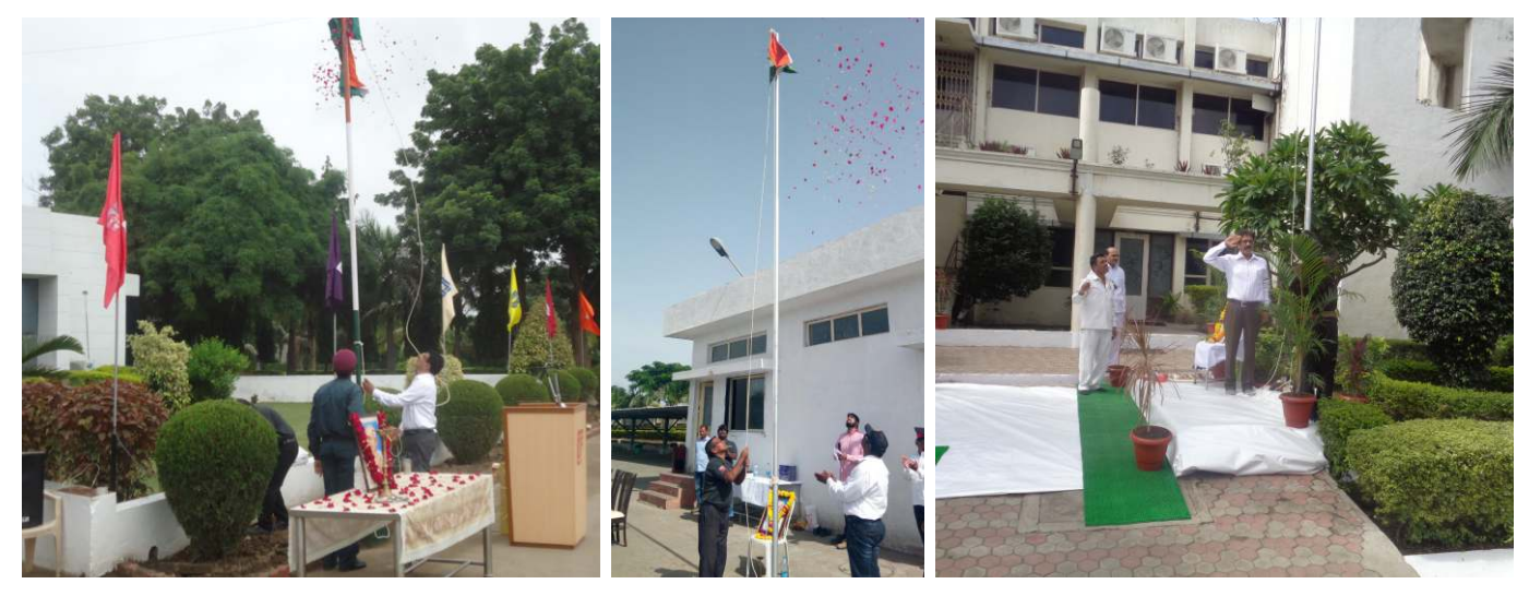
Flag hoisting ceremony at different locations

Objective - Independence Day was celebrated at all the facilities on 15th August 2017 and was commemorated by flag hoisting ceremony. Every year this day is celebrated to pay regards to the brave leaders and fighters of the country. It also creates a lot of pride and togetherness within employees. On this occasion, merit awards were distributed to the meritorious children of Cosmo family as a token of appreciation.