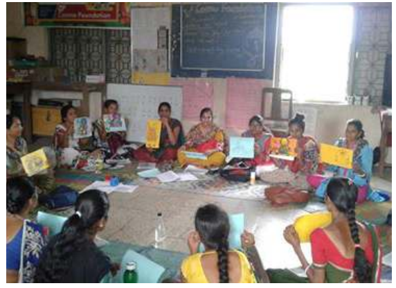
Teachers and interns at vision building workshop