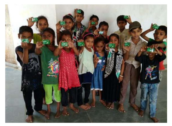
Students felicitated for 100% attendance

Considering the local sanitation and health needs, Cosmo Foundation extended its support by constructing 31 toilets with hand washing facility across eight rural government primary and grant in aid schools in Karjan. This initiative would benefit around thousand girls and women teachers of the schools. Cosmo has also provided cleanliness material, hygiene kit and maintenance manual to the school authorities to maintain hygiene in the toilets.