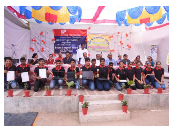
Students felicitated during the award function