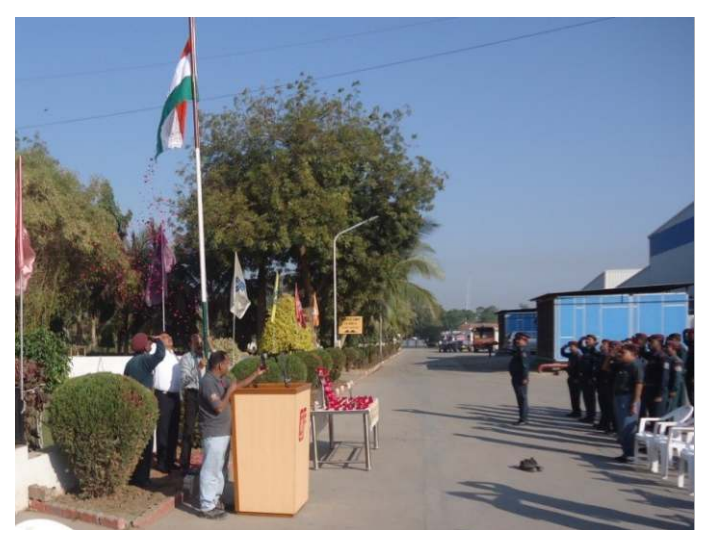
Republic Day celebration at Karjan plant

Objective - Makar Sankranti, the kite flying festival was celebrated at all the plants and witnessed a lot of excitement amongst employees. They enjoyed flying kites with fellow colleagues and showed a great deal of team spirit. The occasion helped in boosting up employee engagement and breaking some monotony from everyday routine.