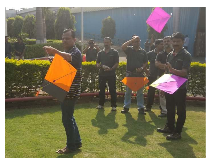
Kite flying competition on the occasion of Makar Sankranti

Activity: Makar Sankranti Celebration Location: Waluj, Shendra & Karjan